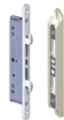
Mortise Lock and Adjustable Keeper

Double point mortise lock system to get higher forced entry rating and steel reinforcements inserted in mullion and opening sash give superior structural resistance.