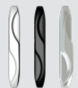
Standard Exterior Finger Pull Handle