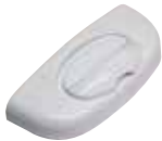
Automatic closing lock