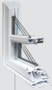
Hung 4 1/2" PVC frame Double opening