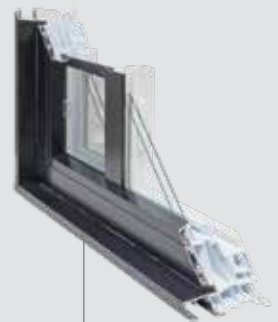
Sliding 5 3/4" HYBRID frame Contemporary sash