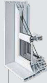
Hung 6 9/16" PVC frame Single opening